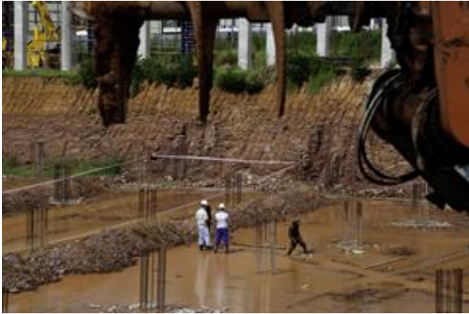
VILLA - PRETORIA