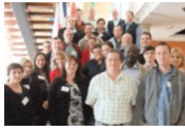
Cape Town group