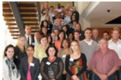
Cape Town workshop